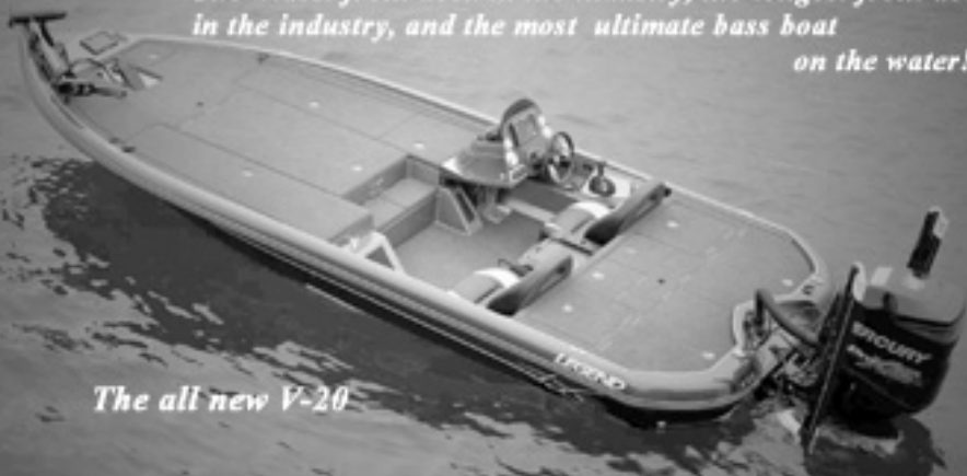
The all new V-20

The widest front deck in the industry, the longest front deck in the industry, and the most ultimate bass boat on the water!